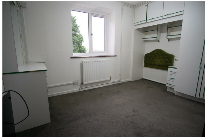
Carpeted and double glazed