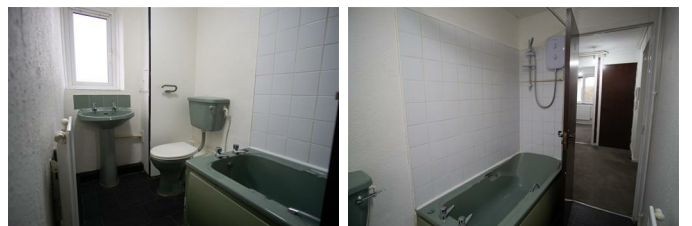
A partially tiled bathroom with bath shower