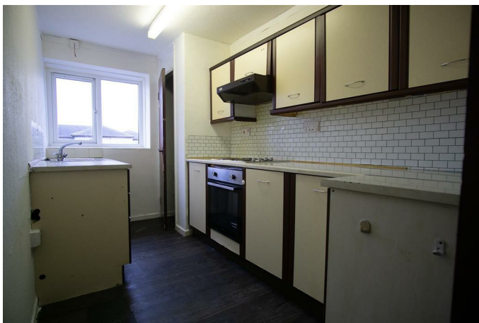
A modern kitchen with plenty of storage and units. The kitchen has a large window for natural light and is well presented.