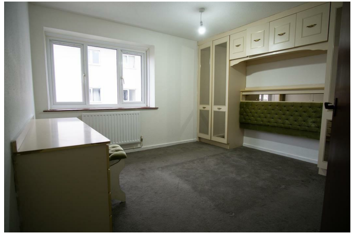
A fully carpeted double bedroom