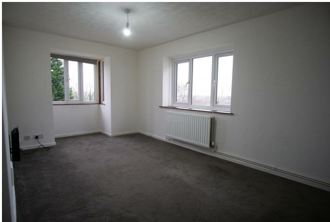
A good spacious living area, that is fully carpeted, 2 large double glazed windows to let in lots of natural light, a large radiator for warmth.